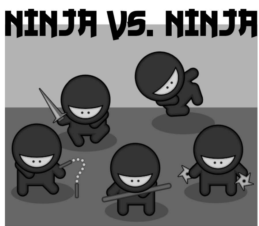
Rthin .ev Rthin .ev Rthin .ev

The best gaming convention on the Central Coast